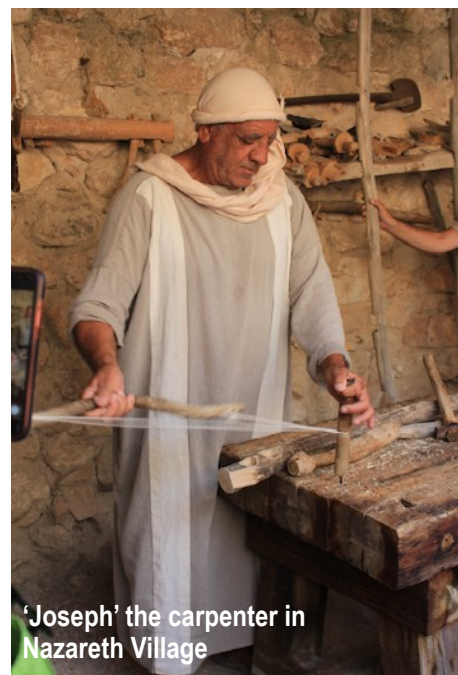
'Joseph' the carpenter in Nazareth Village

Next was Nazareth where Jesus grew up and a reconstruction of life in his times was demonstrated by actors portraying a shepherd, potter, carpenter, weaver, vineyard worker and synagogue priest. We left Nazareth, appreciating anew the culture and poverty in which Jesus must have grown up, and moved to Mount Precipice