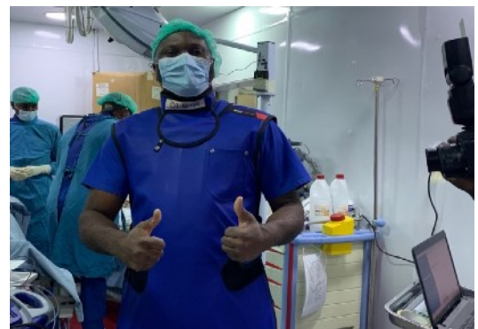
A man receives lifesaving treatment for heart disease. We implanted a dual chamber ICD device for this patient who had suffered a near fatal cardiac arrest in the LIMA hospital, Abuja. The implantation was successful, and the patient was discharged days later.