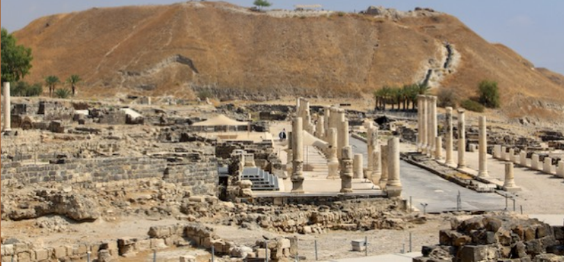
Beit Shan and Scythopolis, Israel

which is reputedly the site where the Jews attempted to throw Jesus off the mountain. (Luke 4:29). Our first day of visits ended with a trip to our hotel in Tiberias on the Sea of Galilee.