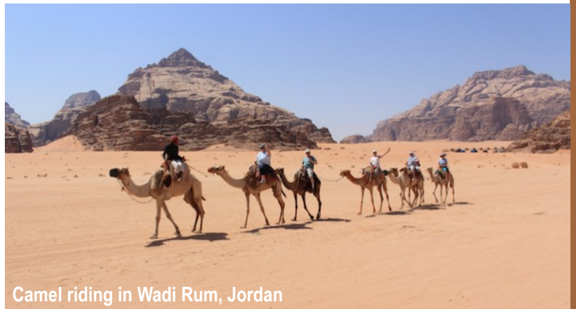
Camel riding in Wadi Rum, Jordan

After dinner each day, we had a devotional time during which people were invited to give their reflections upon the events of the day. This was followed by the singing of choruses, a brief exhortation and a prayer. I found the devotionals to be a highlight of the day with the very harmonious singing and the uplifting messages being appreciated