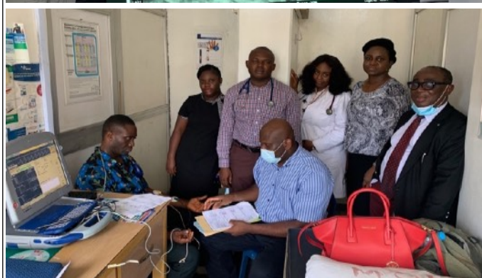
We also performed device follow-up checks in Port Harcourt and Abuja, including some teaching sessions.

coming over to the UK to receive more specialist training in CRT-D implantation. The UK charity Pace4Life also contributed and supported this mission. Pace4Life UK does a fantastic job in saving lives by supplying reconditioned and expired sterility-devices to Sub-Saharan Africa.