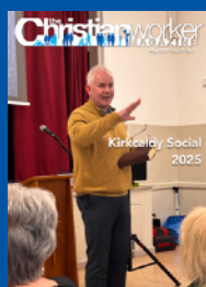
Front cover and above: Kirkcaldy Social Day