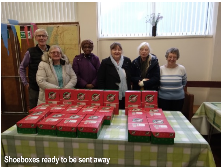
Shoebboxes ready to be sent away

https://www.patternsofevidence.com/2024/08/23/new-biblically-accurate-3-d-animated-model-of-herods-temple/