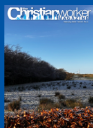
Front cover and above: a frosty morning in Netherburn, Scotland.