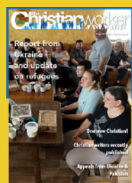
Front cover and above: Feeding displaced people in Ukraine

To receive The Christian Worker Magazine as a free pdf, send your e-address to jdgalloway@mac.com . Professionally printed copies are available at cost. Please contact Trevor for details – twilliams195@hotmail.co.uk .