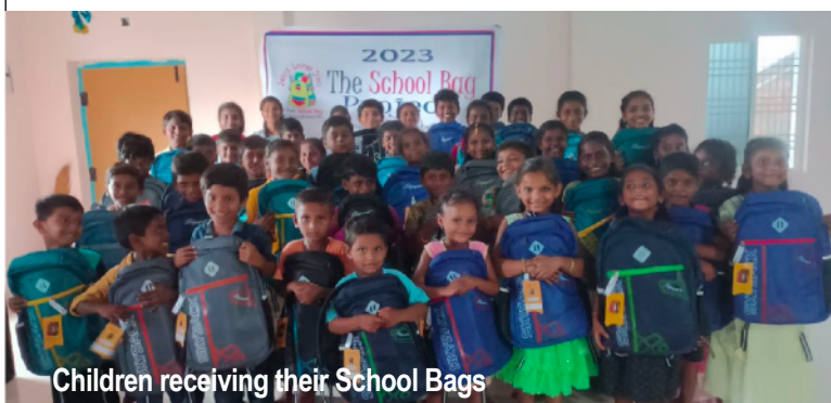
Children receiving their School Bags

We were able to restart our iconic School Bag Project , helping children to stay in school. Since 2010 we have been involved this annual programme, but it was stopped during the Covid years. Thankfully we were able restart this year. A total of 210 children from Yerravaram, Gollaprolu and Akiveedu Villages received this year's School Bag kits which contains a school bag and school supplies. The smiles these kits bring to the innocent faces of these children is what keeps us going from year to year. Thank you all for your prayers and support.