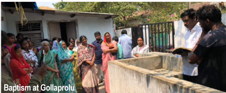
Baptism at Gollaprolu

Bethsaida Child Care Centre. This is our third year since we shifted from Residential Child Care to Non-Residential Child Care. Bethsaida Child Care Centres (BCCs) are running successfully at three locations : Kathipudi, Yerravaram and Gollaprolu. At the beginning of the year we had 112 children enrolled in these centres but now we have of 126. They are being provided with a daily tuition of after school hours, nutritious snacks, periodic health care and spiritual mentoring. We see tremendous transformation among these children. Most of these come from a very marginal backgrounds and illiterate families. They have no one in their families to mentor or monitor them. Our teachers and mentors in these Child Care Centres fill this gap and help them in their holistic development.