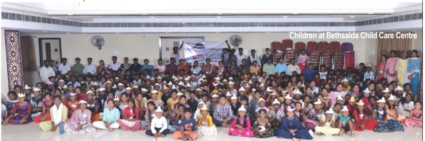
Children at Bethsaida Child Care Centre